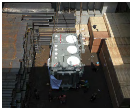
Transformer in a vessel's cargo hold

The unit can be accelerated in three dimensions, requiring it to be restrained and lashed to prevent any motion.