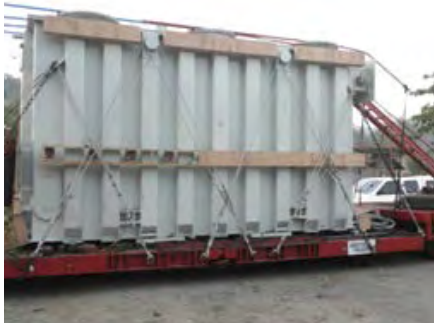
Transformers secured to SPMTs using Chains and Binders (T) and Wires and Turnbuckles (B)

From our experience with North American railways, power transformers undergo scattered impact loads (tens of milliseconds duration) during a trip. These impacts arise by engaging of rail cars and by acceleration and deceleration of the trains. Despite dampers and suspensions in the rail car junctions, these maneuvers may produce strong impacts in the longitudinal direction. Extra care must be taken when designing packing methods for rail transport. An accumulation of small jolts can result in significant damage. To reduce this exposure, we recommend that empty (or “bumper”) rail cars be placed in the front and in the back of the rail car carrying the transformer.