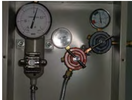
Pressure regulator and gauges

Manufacturers normally fill the tank with oil to the point where it covers the windings, with the space above the windings filled with nitrogen or dry air. The tank is then completely drained of oil and pressurized to approximately 2.0 lbs/in 2 (0.14kg/cm 2 ). A bottle of compressed gas with appropriate gauges is usually fitted to the side of the unit to maintain this pressure during transportation.