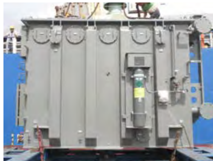
Nitrogen bottle and regulator

Valves are closed and drains plugged, before a leak test is carried out to ensure the tank is vapour tight.