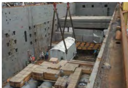
Transformers being lifted from ocean vessel cargo hold

Generally, the stability of the entire system is dependent on the relationship between the rigging angle as it hangs from the hook and the angle between the center of gravity of the load to its lifting locations.