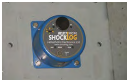
Electronic Impact Recorders

For transformer shipments, it would be prudent to ensure that more than one