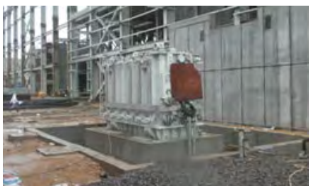
Main and standby transformers on their foundations

Electrical power is generated instantaneously, it cannot be readily stored. Most major power generation and distribution systems use alternating current, though some long distance systems employ high voltage direct current.