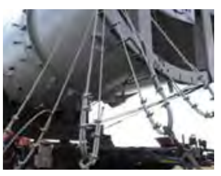
Wire lashing arrangements offer extra insurance against cargo movement.

As a general rule, and for nearly any size of ship, the 'total of the MSL (maximum securing load) values of the securing devices on each side of a unit of cargo (port and starboard) should equal the weight of the unit (in kN)'. This rule of thumb implies a transverse acceleration of 1 g (9.81m/s<sup>2</sup>), and applies regardless of the location of the stowage, its stability and loading condition, the season, or area of operation of the cargo vessel.