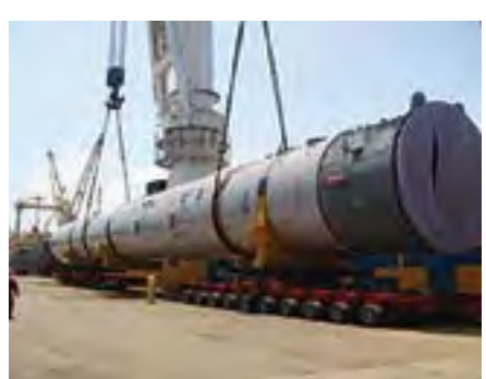
A tandem lift compensates for an off-centre CoG.